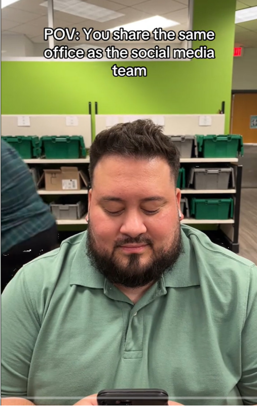
Click the photo above to view the TikTok